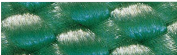
Multi-filament yarns shown as woven fabric

FLUITEX ® airslide fabrics are used for conveying free flowing powder and granulate bulk materials. Airslide fabrics are produced using various textiles and yarns. This enables us to offer customers fabrics of various thicknesses, air permeability, tensile strength and heat resistance.